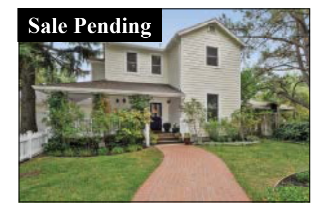
162 S. Cody Ln, Pleasant Hill Storybook, Farmhouse 4 Bedrooms, 2.5 Baths, 1872 Sq Ft 2-story List Price $749,000 - Pending well over! See my photography and staging at www.162SouthCody.com

564 Banyan Cir, Walnut Creek Fabulous remodeled home with pool in The Woodlands 5 Bedrooms, 3.5 Baths, 2,770, Sq Ft, 2-Story List Price $995,000 - Sold for $1,175,000 Steve represented the lucky Buyers!