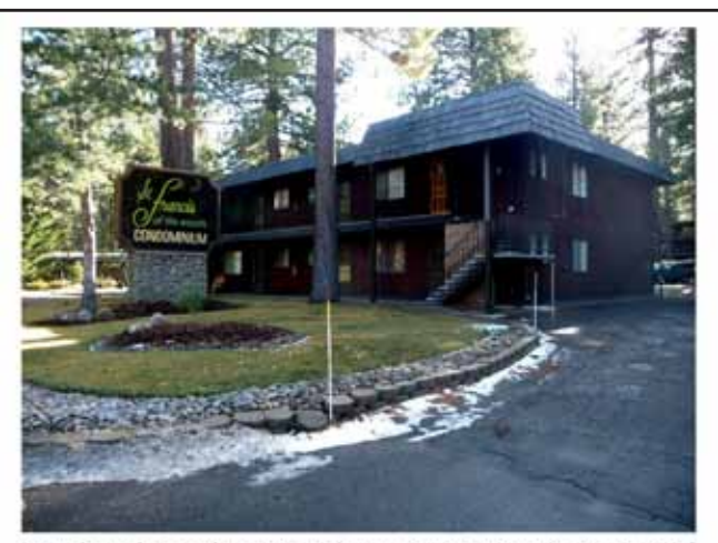
South Lake Tahoe Condominium Vacation Rental

St. Francis of the Woods 516 Emerald Bay Rd South Lake Tahoe, California