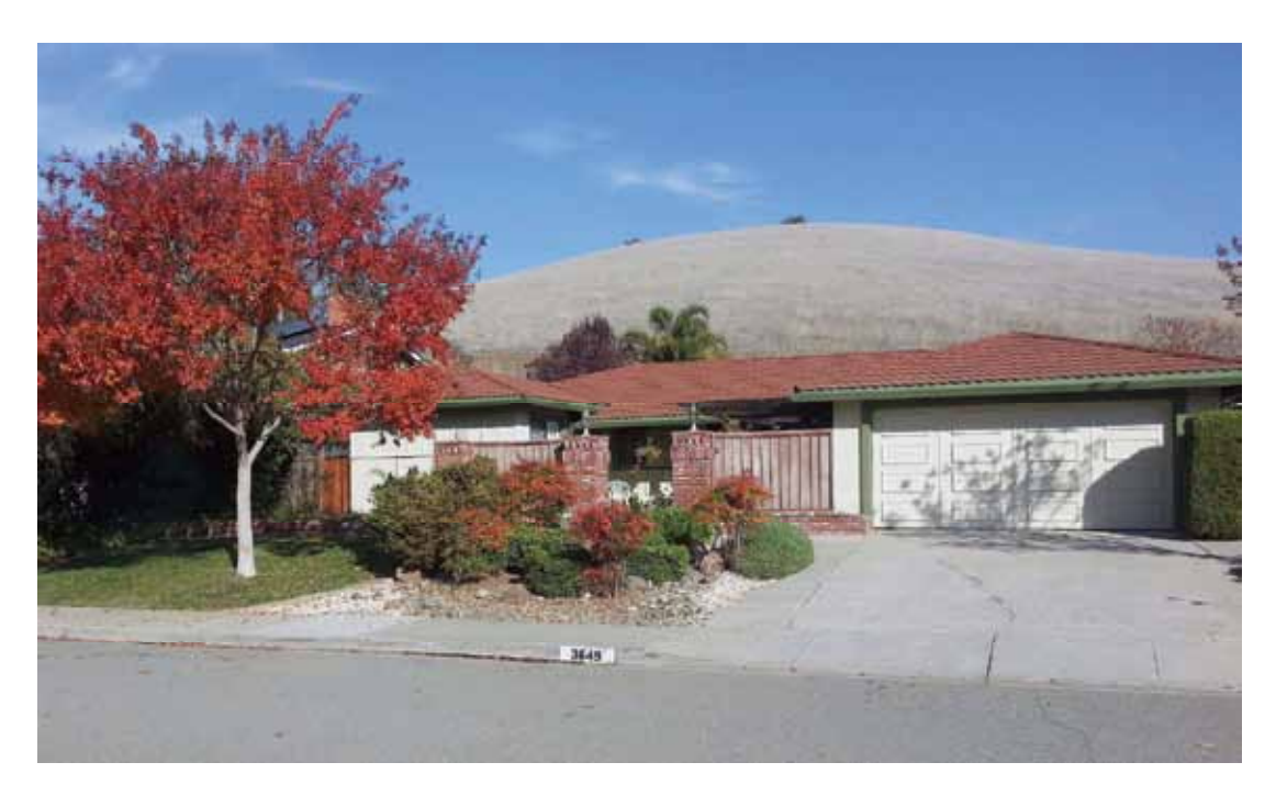
Thinking about a move? Make sure to include the marketing professional in your interviewing process. You have choices, Choose wisely!

Beautifully Updated 4 Bedroom, 2 Bath 1,865 Sq. Ft. home on a quiet street, backing to open space in The Woodlands. Offered at $859,000 . Please visit SteveHansenHomes.com for more information and photos.