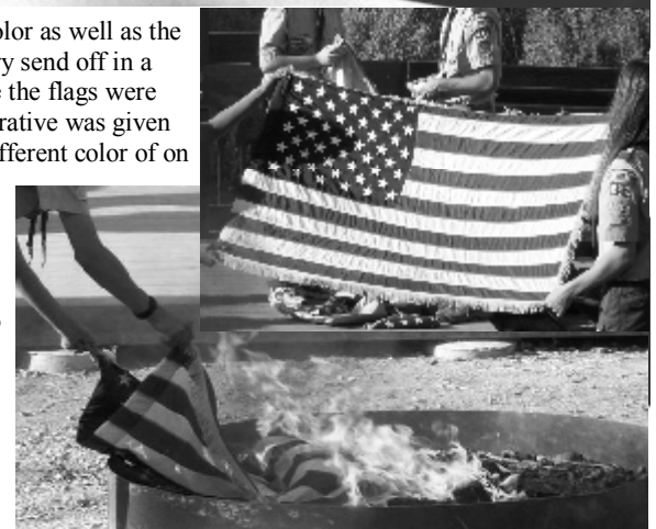
Flag Retirement Ceremony