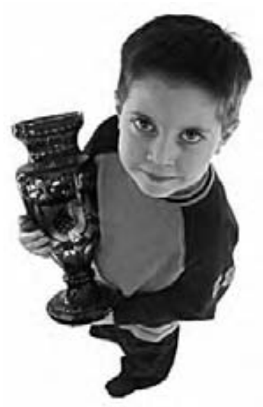
Want to Sell Something? Use us!