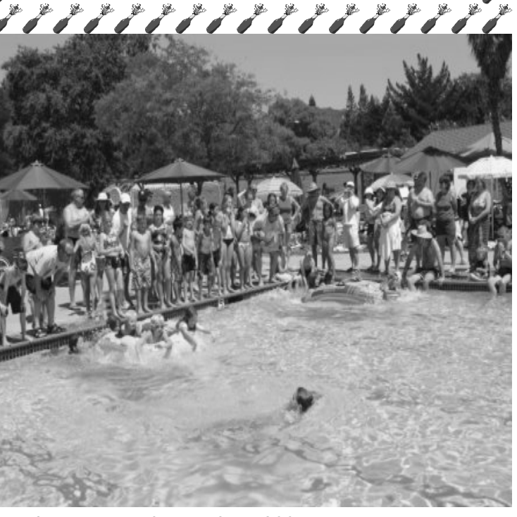
Raft races at the Cabana Club-2005

Everyone in the Woodlands is invited to the Cabana Club from noon to 5:00 pm. The club will be open for great games for the kids and great food for all on this special afternoon of making new friends and seeing old friends. What a great tradition! Games include the raft races, the pool coin toss and the candy toss.