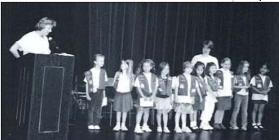
Valle Verde Brownie Troop 1865 was awarded the “Super Troop” award.