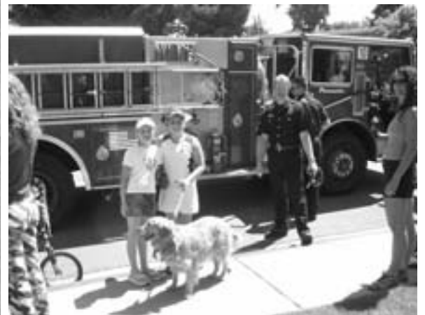
July 4th, 2004