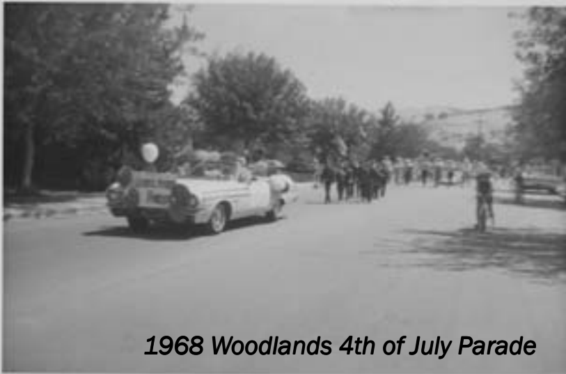
1968 Woodlands 4th of July Parade