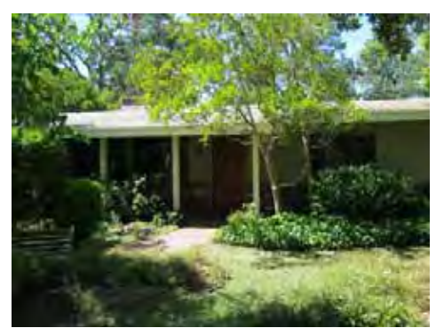
SOLD in 20 Days