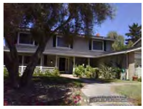
PENDING: 677 Rock Oak - W. Creek