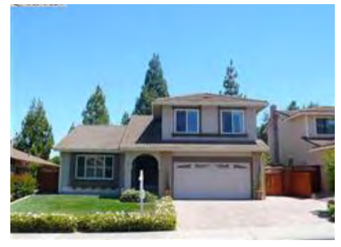
SOLD to Buyers