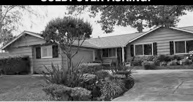
3416 PEACHWILLOW LANE • SOLD $1,035,000 4 bedroom, 2 bath, 1,800 sq ft, 8600 sq. ft. lot