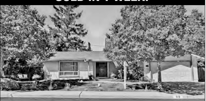
619 BANYAN LANE • $975,000 3 bedroom, 3 bath, 1931 sq ft, 8500 sq. ft. lot