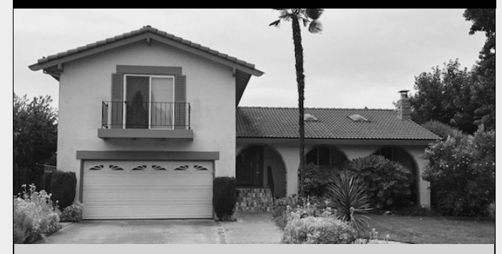
3658 CITRUS AVENUE • $969,950 3 bedroom, 2 bath, 1950 sq ft, 8855 sq. ft. lot