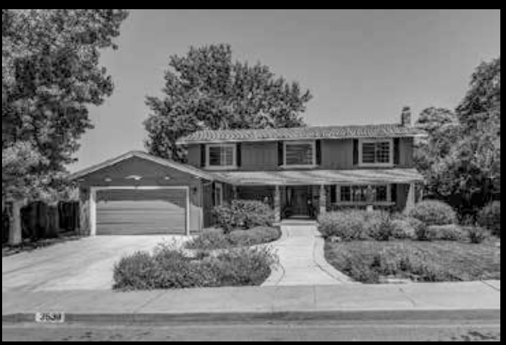
Listed at $1,089,000 - Pending