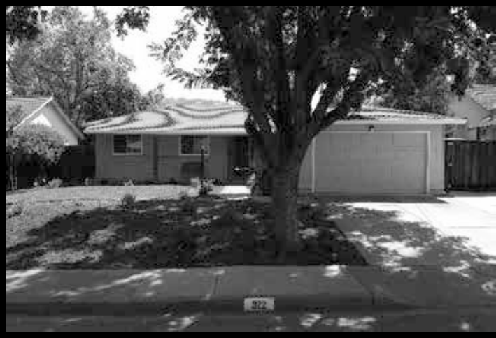
Listed at $929,000