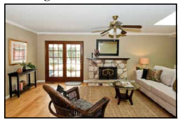
131 Clyde Drive

The Woodlands~Northgate 4 Bedrooms, 2 Baths, 1-story List Price $825,000 - Sold for $860,000 Information and photos at www.3415BayberryDr.com