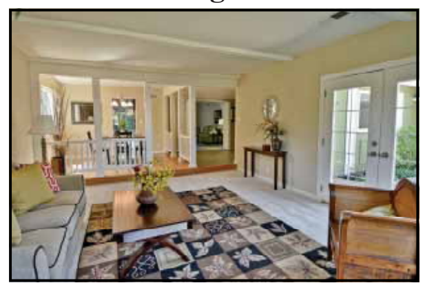
3415 Bayberry Drive

The Woodlands~Northgate 4 Bedrooms, 2 Baths, 1-story List Price $825,000 - Sold for $860,000 Information and photos at www.3415BayberryDr.com