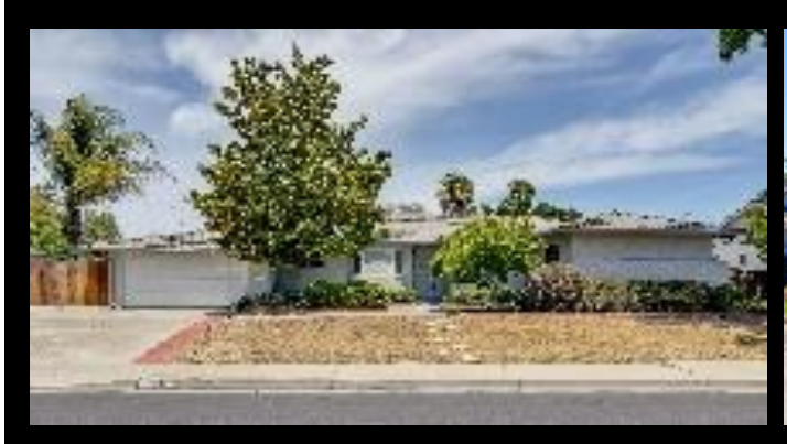
2234 Gill Port Lane, Walnut Creek Offered at $759,000 ACTIVE