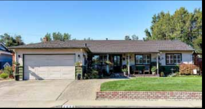
4626 Brenda Circle, Concord Offered at $575,000 PENDING