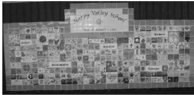
Happy Valley School's Tile Wall Pictured Above as an example

The VV PTA is raising money to replace its outdated computer lab equipment through a one-time-only life skills wall campaign. Creating a life skills wall with tiles that emphasize model behaviors leaves a positive and lasting message to the students of today and the future.